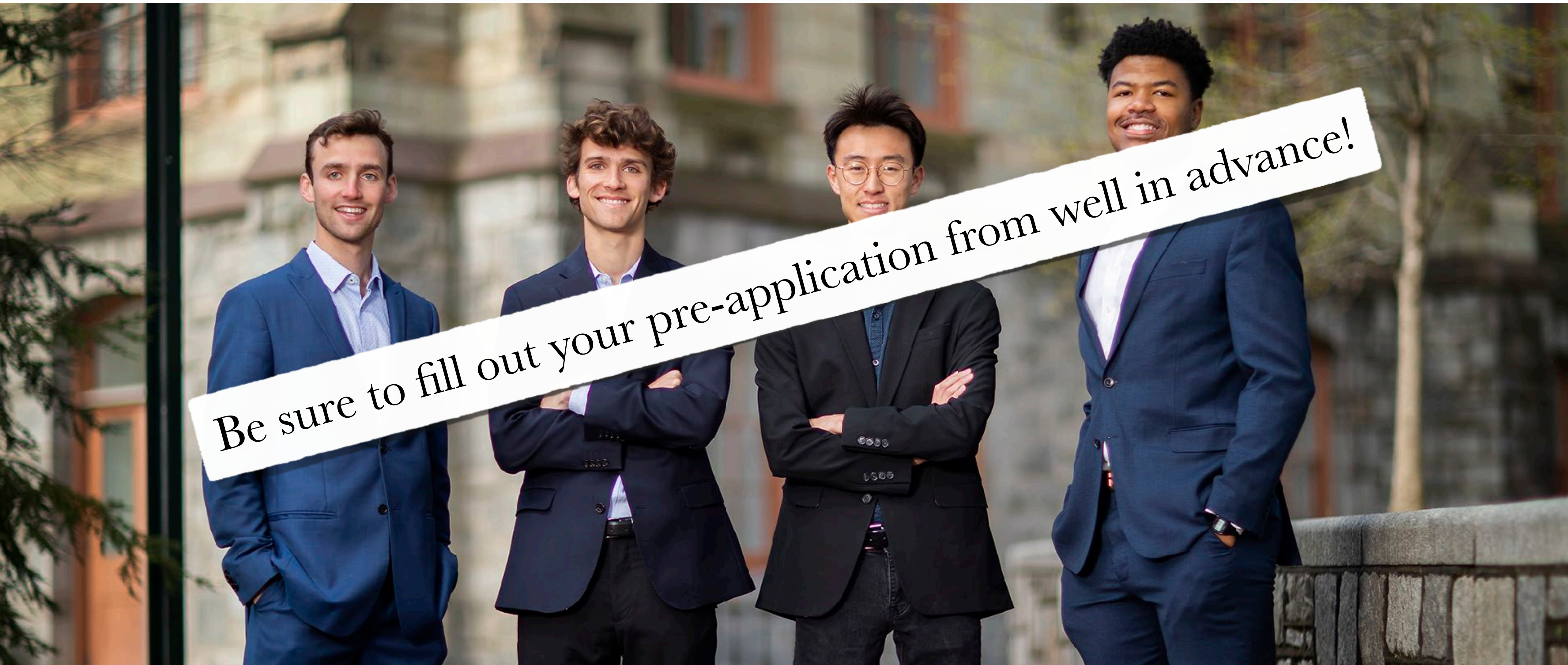
Pictured: Impact First Ventures, 2022 PEP recipient

Be sure to fill out your pre-application from well in advance!