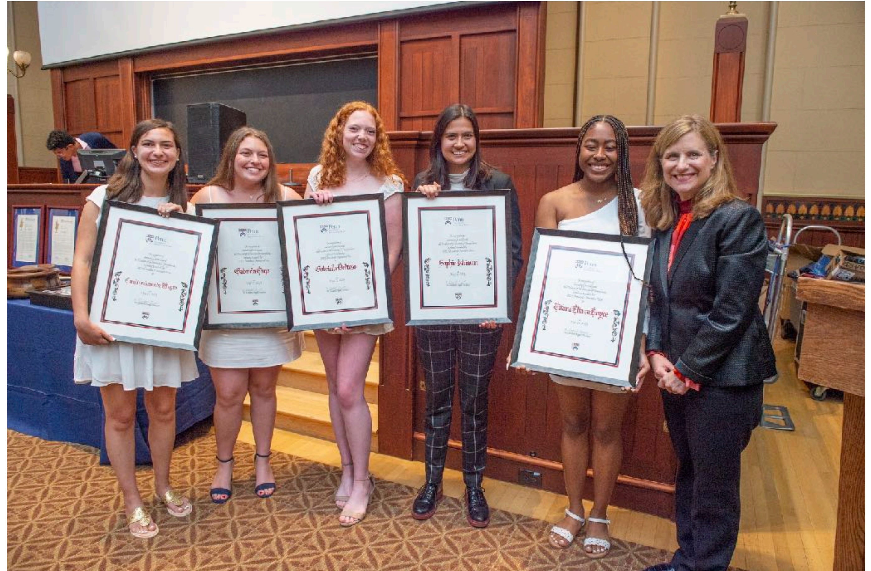
Pictured: Sonura, 2023 PIP recipient