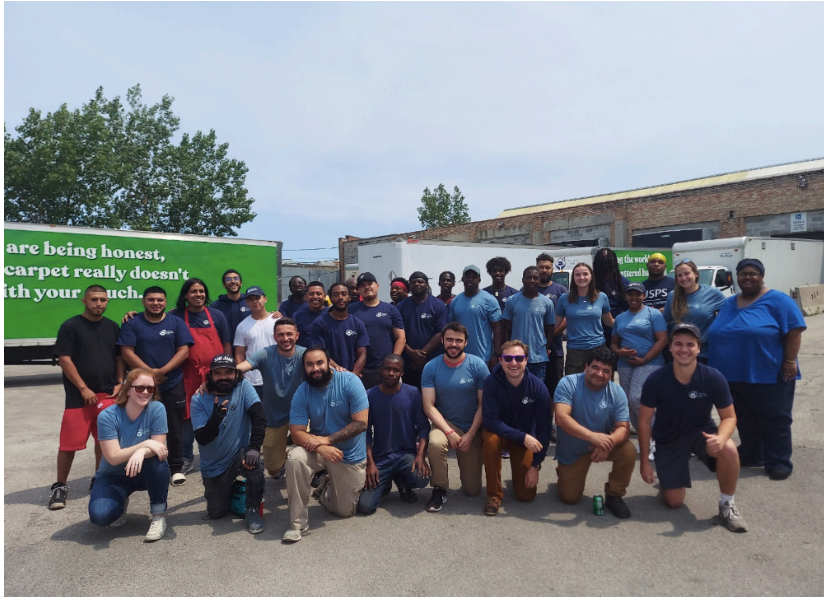
Pictured: Chicago Furniture Bank, 2018 PEP recipient